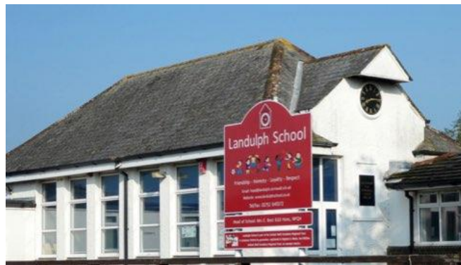
Landulph Primary School showing the World War One Clock