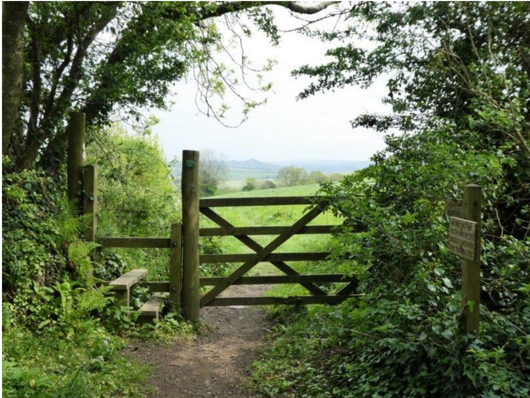
Footpath in the Parish