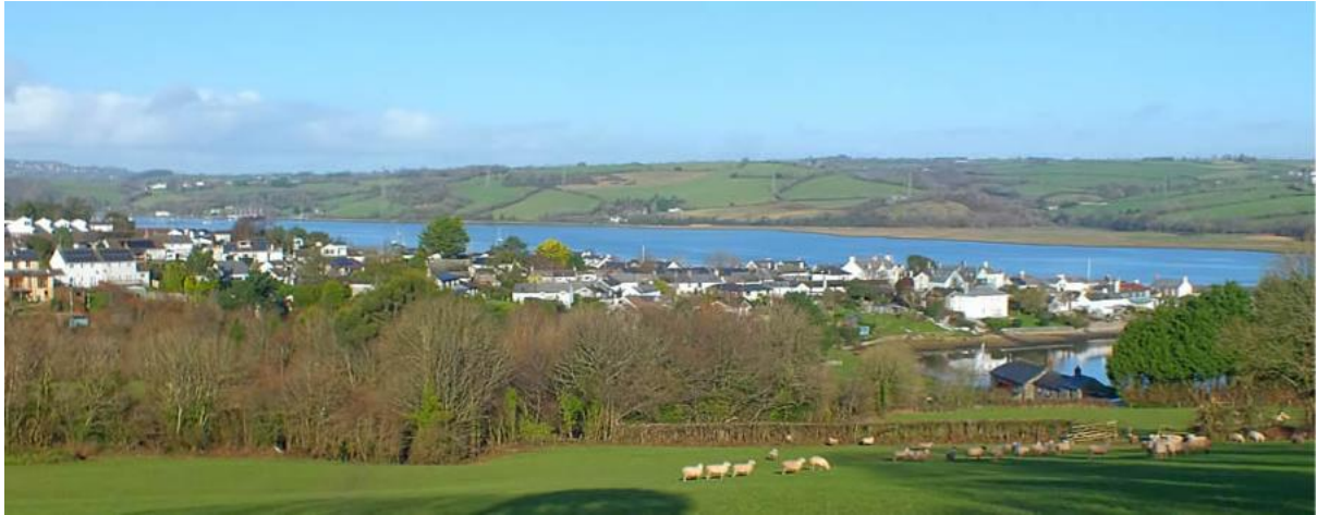
Village of Cargreen