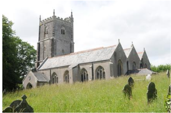
St Leonard and St Dilpe