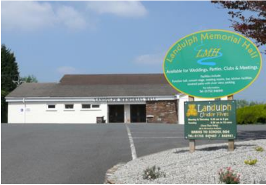
Landulph Memorial Hall