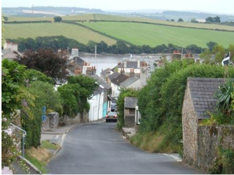
Cargreen Village looking towards the Tamar river